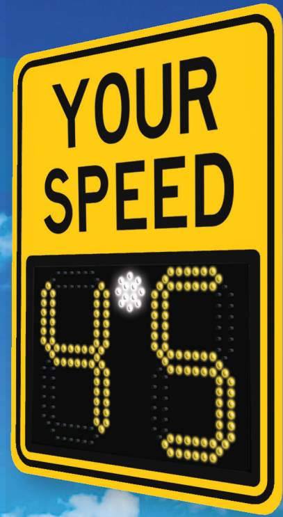
Choice of faceplate colors available

The Traffic Logix® SafePace® 100 driver feedback sign is the solution that fits your budget.